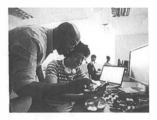
2022 School/District Grant Program Application Available