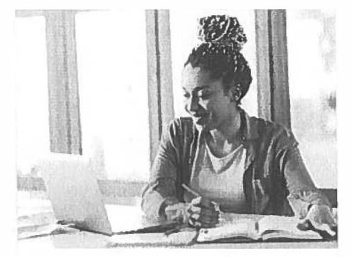
Fall 2022 Increasing Educator Diversity Scholarship and Fee Reimbursement Opportunity