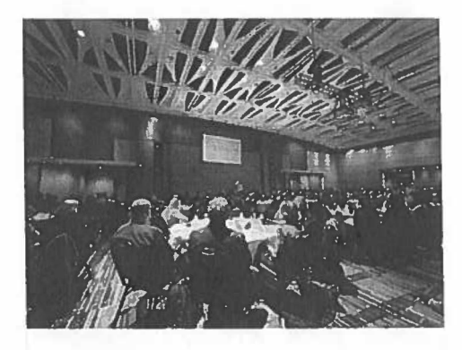
Igniting Change conference focuses on equity-centered learning