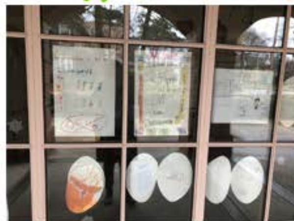
Displaying Student Work