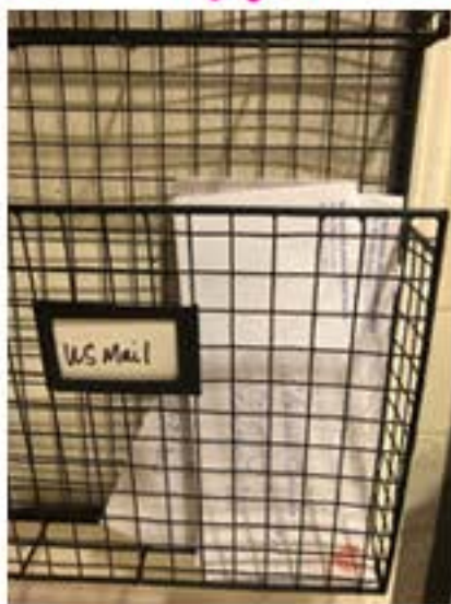
Letter Writing to Students