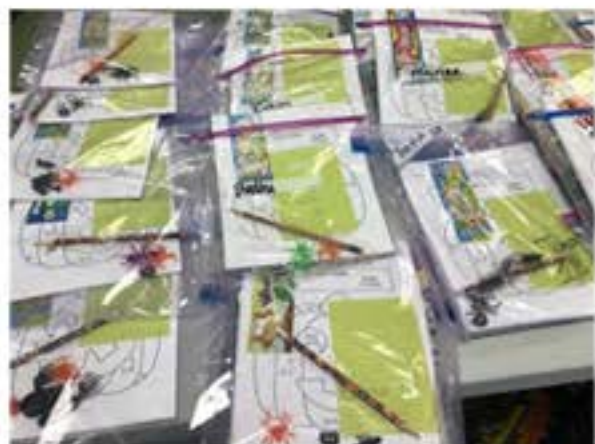
K-2 Material Distribution