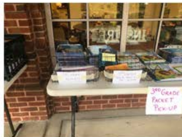
3-8 Material Distribution