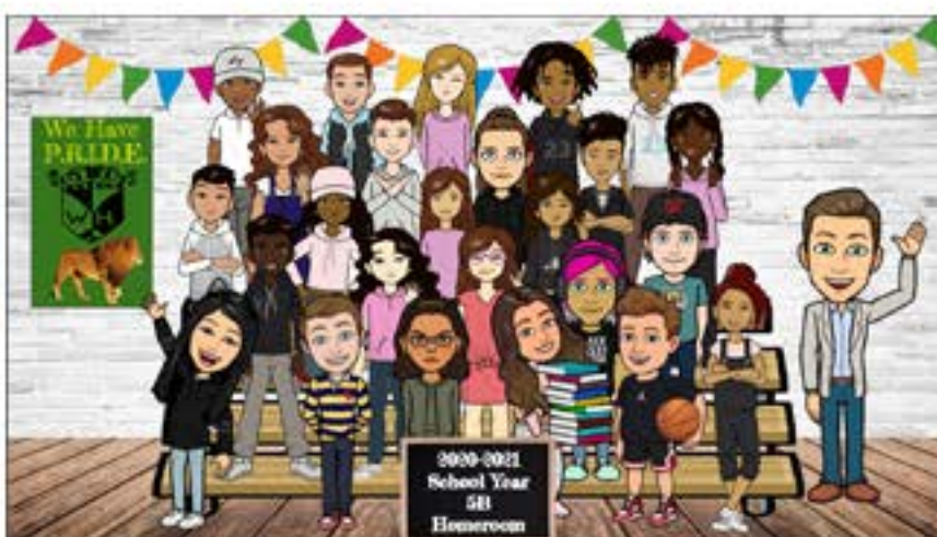
Community Building During Distance Learning